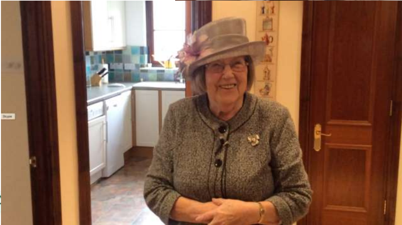
The new hat