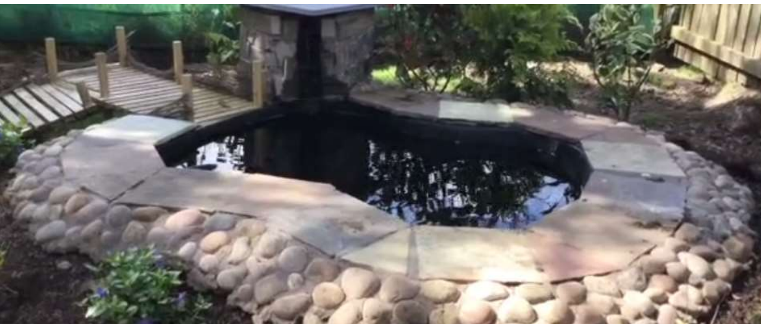
The duck pond