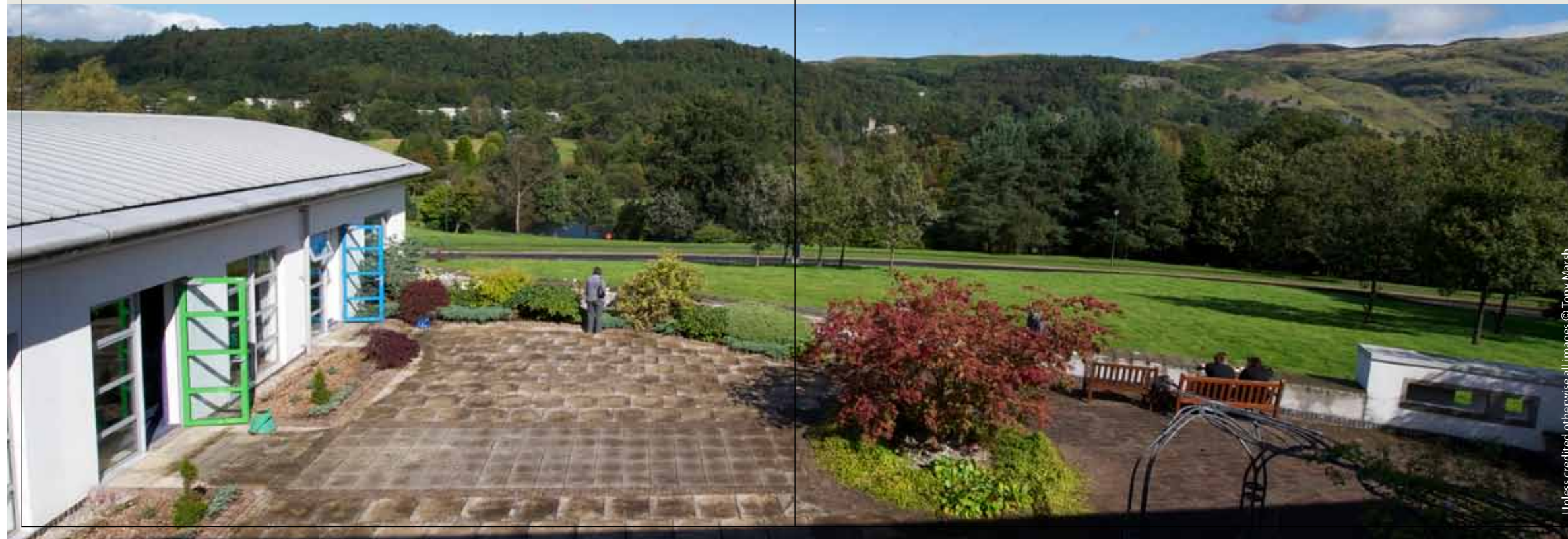
Unless credited otherwise all images © Tony Marsh

“When using the Iris Murdoch Building you are supporting the Dementia Services Development Trust”